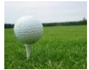
Time to tee off in 2010!