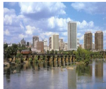
Richmond, VA Skyline.